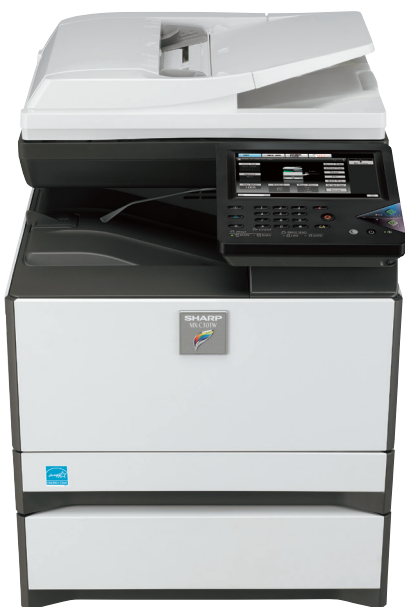
Shown with optional paper drawer.