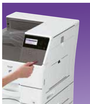
Conveniently located USB port

Choose a high performance printer to get the productivity you require