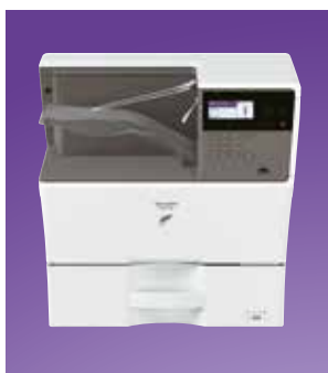
Compact desk top configuration