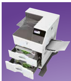
Expandable paper capacity